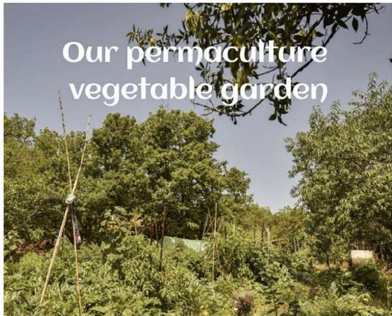
Our permaculture vegetable garden